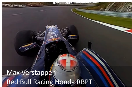
Max Verstappen Red Bull Racing Honda RBPT