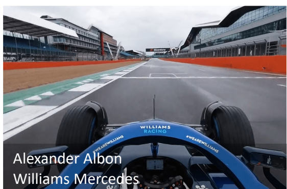
Alexander Albon Williams Mercedes